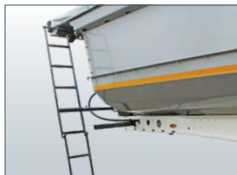
... pull-out access ladder (optional)