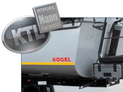
..... corrosion protection