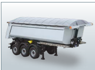
... electrical tipper cover (optional)