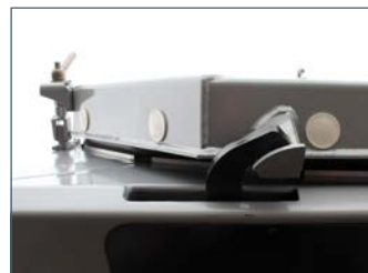
..... locking hook