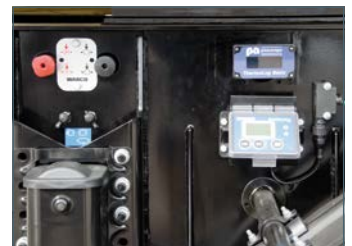
..... neatly arranged control unit