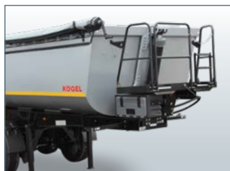
..... control pedestal