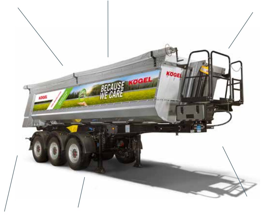
Hinged underride guard